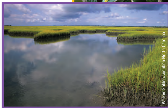
Walker Golder/Audubon North Carolina

Bonus: Use recycled paper to make a nature journal. Draw or describe the animals you see this week. Which do you see often? Which do you see sometimes? Why?